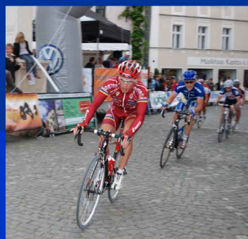
Germany - 2008 Abendsdorf, criterium 5th place