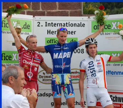
Paderborn trilogy Germany, 2008

Three stage race, 2nd place in general classification (9th, 4th and 2nd place in stages)