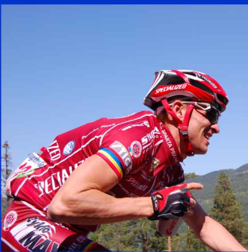
GP Ringerike Norway, 2008

Three stage race, 2nd place in general classification (9th, 4th and 2nd place in stages)