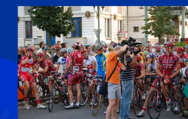
Mladá Boleslav - 2008 6th place, 6x bonuses