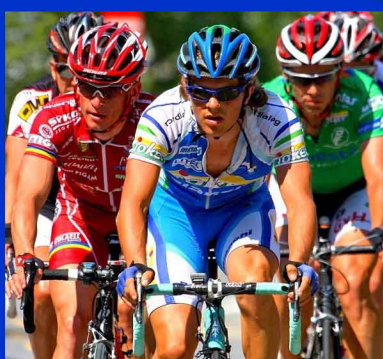
GP Ringerike Norway, 2008