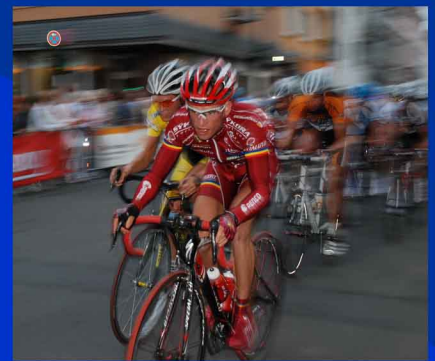
Krefeld Germany, 2008