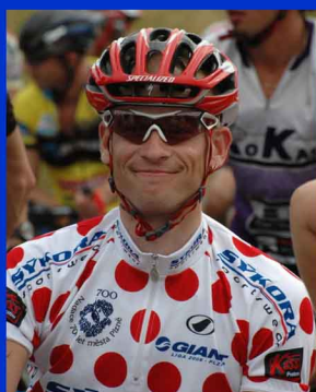
Giant league Pilsen, 2008