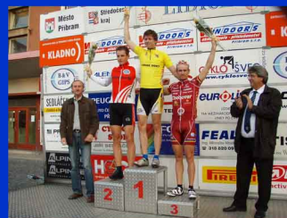
Příbram - 2007 3rd place Stage 1, Lidice