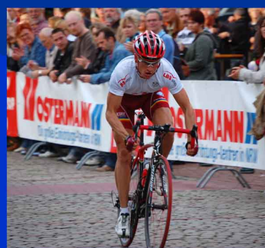
Sparkassen Giro, criterium Germany, 2008