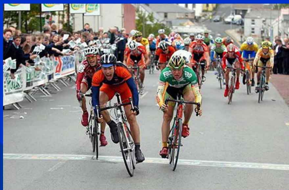
Ireland - 2007 FBD Insurance RÁS UCI 2.2, 3rd place in hard finish at stage 4.